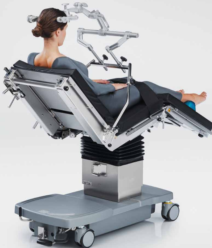
Neurosurgery in Beach-chair position