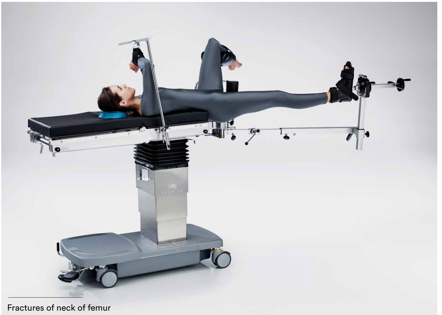
Fractures of neck of femur