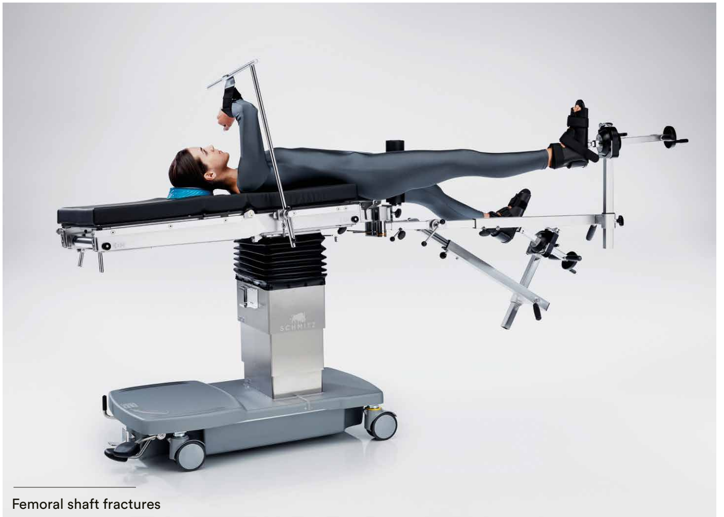
Femoral shaft fractures