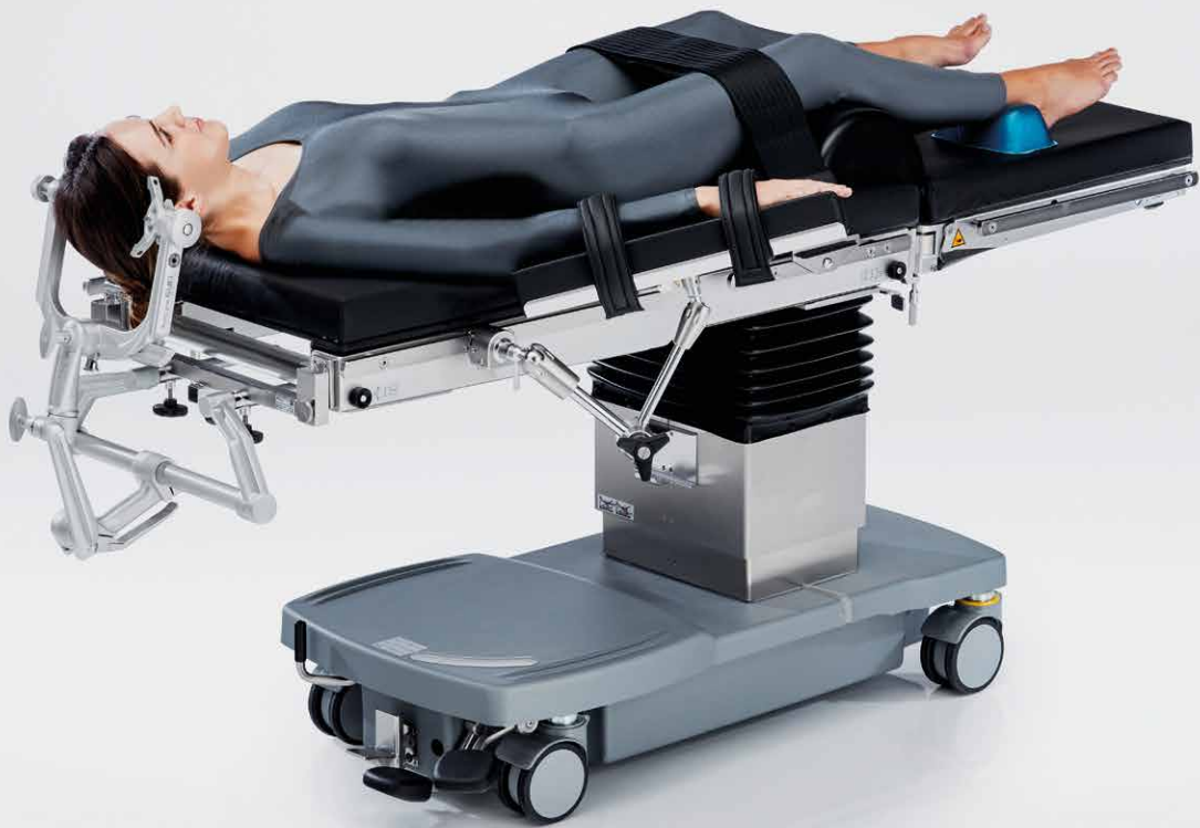
Neurosurgery in supine position