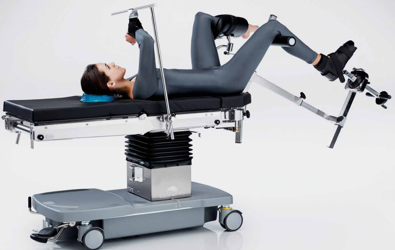
Lower leg fractures